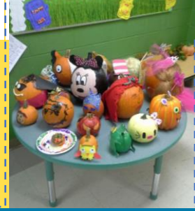
First Grade Parents Take a look at some of the AWESOME pumpkin projects our first grade